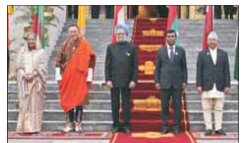
Asian nations sign trade, environmental accords