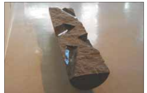
New work by sculptor Michihiro Kosuge