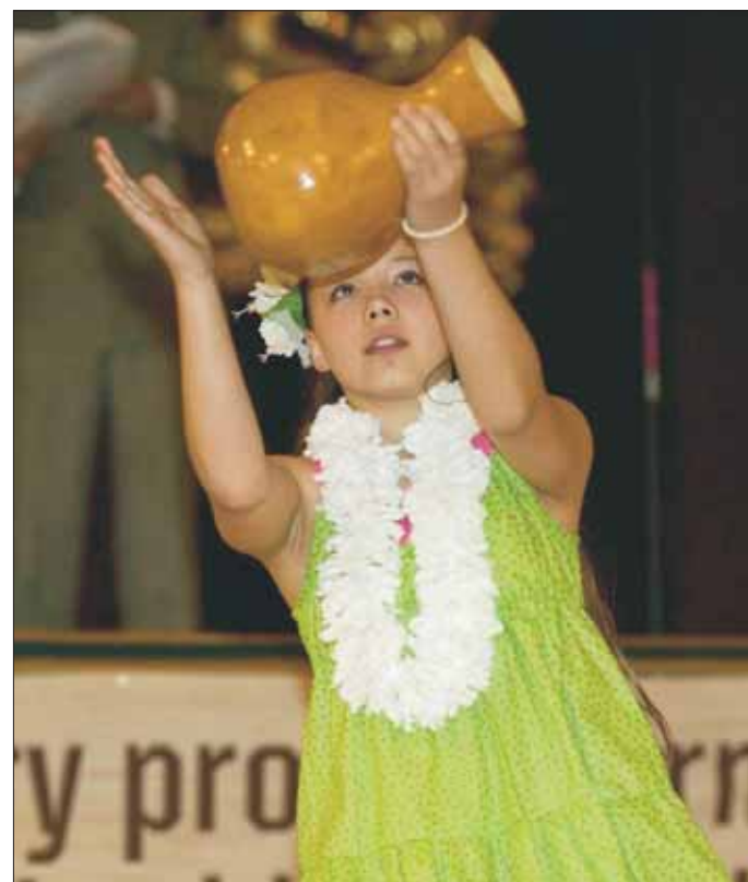
ASIAN ARTISTRY. Vietnamese Buddhist Youth Association Minh Quang lion dancers (left) and a young member of Hula Hālau 'Ohana Holo'oko'a perform for the crowd at The Asian Reporter Foundation's 12th annual Scholarship & Awards Banquet.