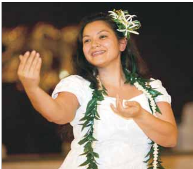
COMMUNITY TREASURES. Banquet attendees witnessed the presentation of Most Honored Elder awards (top photo) and were entertained by (second photo from top to bottom photo) the Mt. Tabor Middle School Multicultural Performers, the Dance Mandala Group, and Hula Hālau 'Ohana Holo'oko'a.